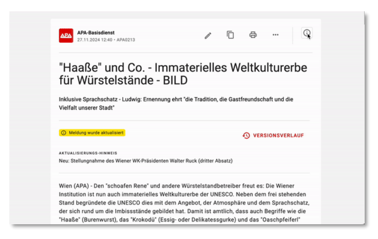
Fig. 3: Show/hide metadata: click-to-inspect in text journalism

Admittedly, this approach is quite demanding on users, who have to actively retrieve the information.