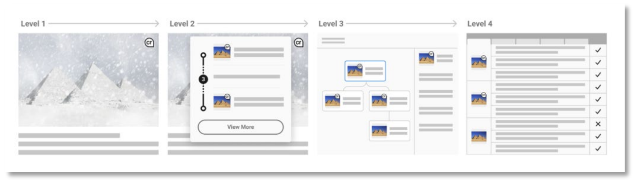
Fig. 1: Levels of Disclosure: click to inspect

In terms of architecture, the concept is inspired by the UX recommendations of the Coalition for Content Provenance and Authenticity (<u>C2PA</u>), which provides several levels of information according to the click to inspect principle.<sup>87</sup>