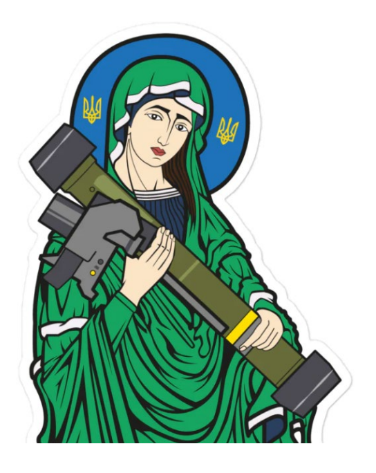
Saint Javelin's logo, a play on the Virgin Mary iconography featuring an anti-tank missile launcher

Saint Javelin does not only makes memes online; it manufactures merchandise with them. The most famous example of this is the brand's logo, Saint Javelin of Ukraine: an icon-style picture of Virgin Mary holding a Javelin portable anti-tank missile, one of the first Western weapons supplied to Ukraine.