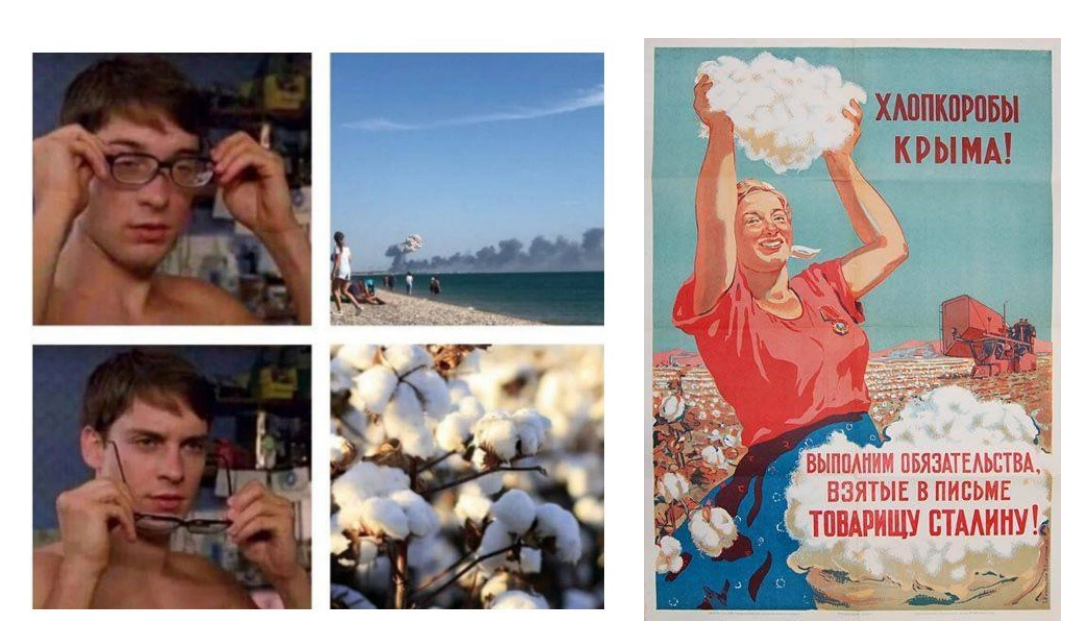
Examples of memes deriding Russia's use of a word with dual meaning (cotton, bang) to explain the demolition of their weapons stores.

Another example of a similar in-joke is the bavovna (cotton) meme: a cotton flower is frequently featured in various memes shared by Ukrainians and even foreign officials, such as <u>the UK former ambassador to Kyiv</u>.