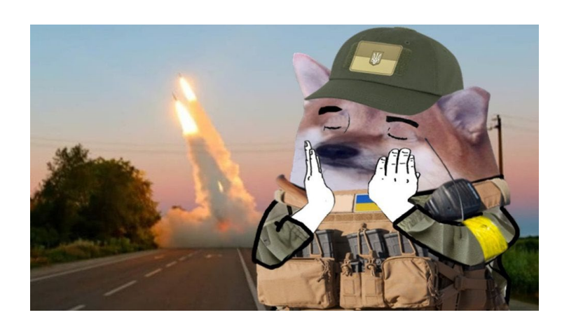
An example of a NAFO dog meme, which borrows from the Shiba Inu dog meme

It resulted in a creation of NAFO (the North Atlantic Fella Organization, which is a play on NATO - North Atlantic Treaty Organization), described by Politico as a "shit posting, Twitter-trolling, dog-deploying social media army taking on Putin one meme at a time".<sup>6</sup>