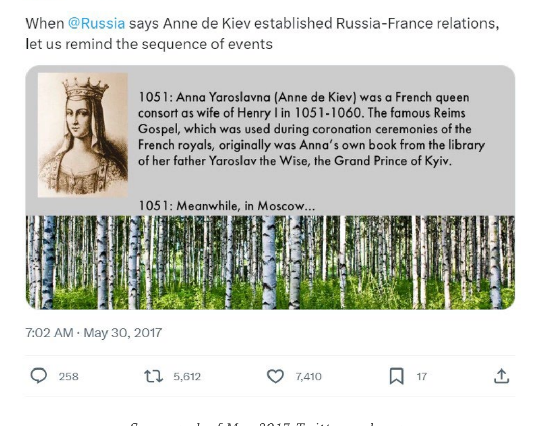
Screengrab of May 2017 Twitter exchange