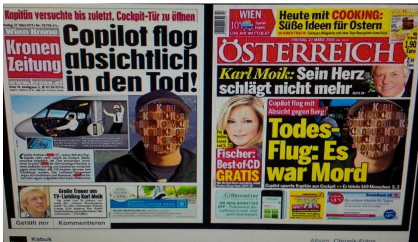
Figure 1: https://www.facebook.com/kobuk/photos/pb.282064592970.-2207520000.1446453266./10153687703872971/?type=3&theater , 2. November 2015.